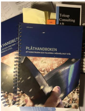
Picture 1: The revision of the Design Handbook, here the Swedish version, is ongoing

Both Jan-Olof Sperle and Jan Kuoppa were very deeply involved when the first edition of the Design Handbook was written in 1990. Later it was followed by a series of books. The modern Eurocode and the most recent result were implemented lately.